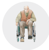
Carl mobility spectrum