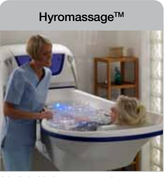
A built-in Hydromassage unit creates millions of small bubbles and agitation in