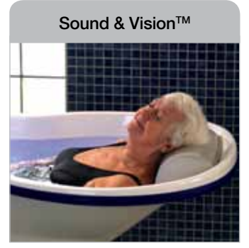
Colourful underwater lighting and soft music stimulus enhances the power of bathing to calm stressed or anxious patients and residents.