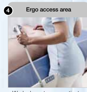
Work closer to your patient Reduce static load Improve work-flow