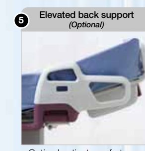
Optimal patient comfort Easier and efficient patient transfers