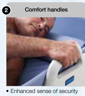
Promotes participation and mobility Provides support