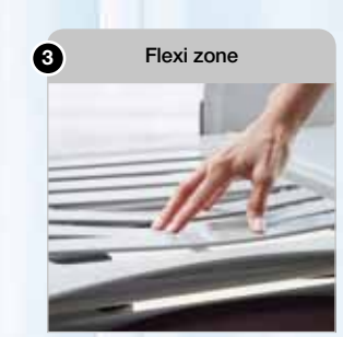
Improved comfort Pressure relieving • Easier handling and access