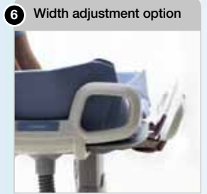
Greater versatility for more patient requirements Easier transfers and more handling options