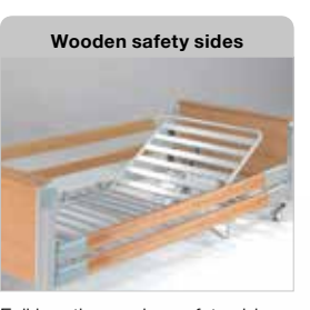
Full length wooden safety sides (pair) CM-ACC00.52