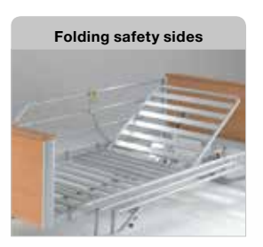
Steel folding safety sides (pair) CM-ACC06.52