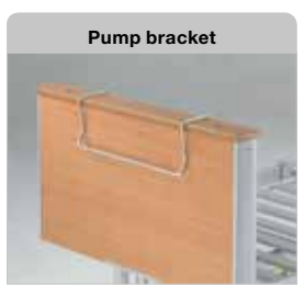
Pump bracket CM - ACC15