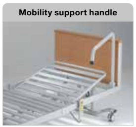
Mobility support handle CM – ACC11 Left handed CM – ACC12 Right handed