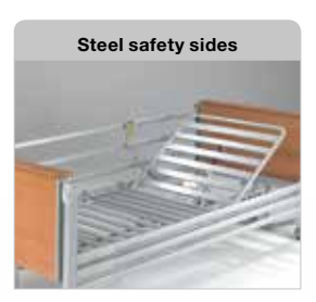
Full length steel safety sides (pair) CM-ACC04.52