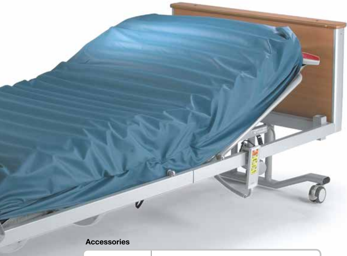
Product Code Description CM-ACC00-1.52 Full Length Standard Height Wooden Safety Sides (Grey/Beech) CM-ACC00-3.52 Full Length Standard Height Wooden Safety Sides (Brown/Beech) CM-ACC01-1.52 Full Length Standard Height Wooden Safety Sides (Grey/Cherry) CM-ACC00-1.14 Full Length Extra Height Wooden Safety Sides (Grey/Beech) CM-ACC00-3.14 Full Length Extra Height Wooden Safety Sides (Brown/Beech) CM-ACC01-1.14 Full Length Extra Height Wooden Safety Sides (Grey/Cherry) CM-ACC01-3.14 Full Length Extra Height Wooden Safety Sides (Brown/Cherry) CM-ACC03 Pads for Full Length Safety Sides CM-ACC04-1.52 Full Length Standard Height Steel Safety Sides CM-ACC06-1.52 Steel 3/4 Length Standard Height Folding Safety Sides CM-ACC07-1.52 Steel Extra Height Folding Safety Sides CM-ACC09 Lifting Pole with strap and handle CM-ACC11 Mobility Support Handle (to fit left side of bed) CM-ACC12 Mobility Support Handle (to fit right side of bed) CM-ACC13 Flexible Handset Holder CM-ACC14 IV Pole CM-ACC15 Mattress Pump Bracket CM-ACC17 Urine Bag Holder CM-ACC22-1.52 Egress Assist Rail Standard Height (Grey) CM-ACC23-1.52 Egress Assist Rail Extra Height (Grey) CM-ACC24 Mattress Retainers (supplied with the bed) CM-ACC26 Full Length Safety Side pads with top cushion