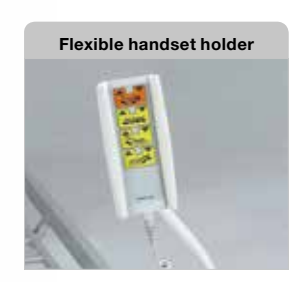
Flexible handset holder CM – ACC13