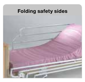
Steel extra height folding safety sides (pair) CM-ACC07.52