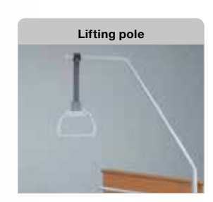
Lifting pole CM - ACC09 Single position